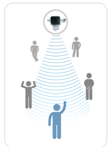
Acoustic Hailing Device